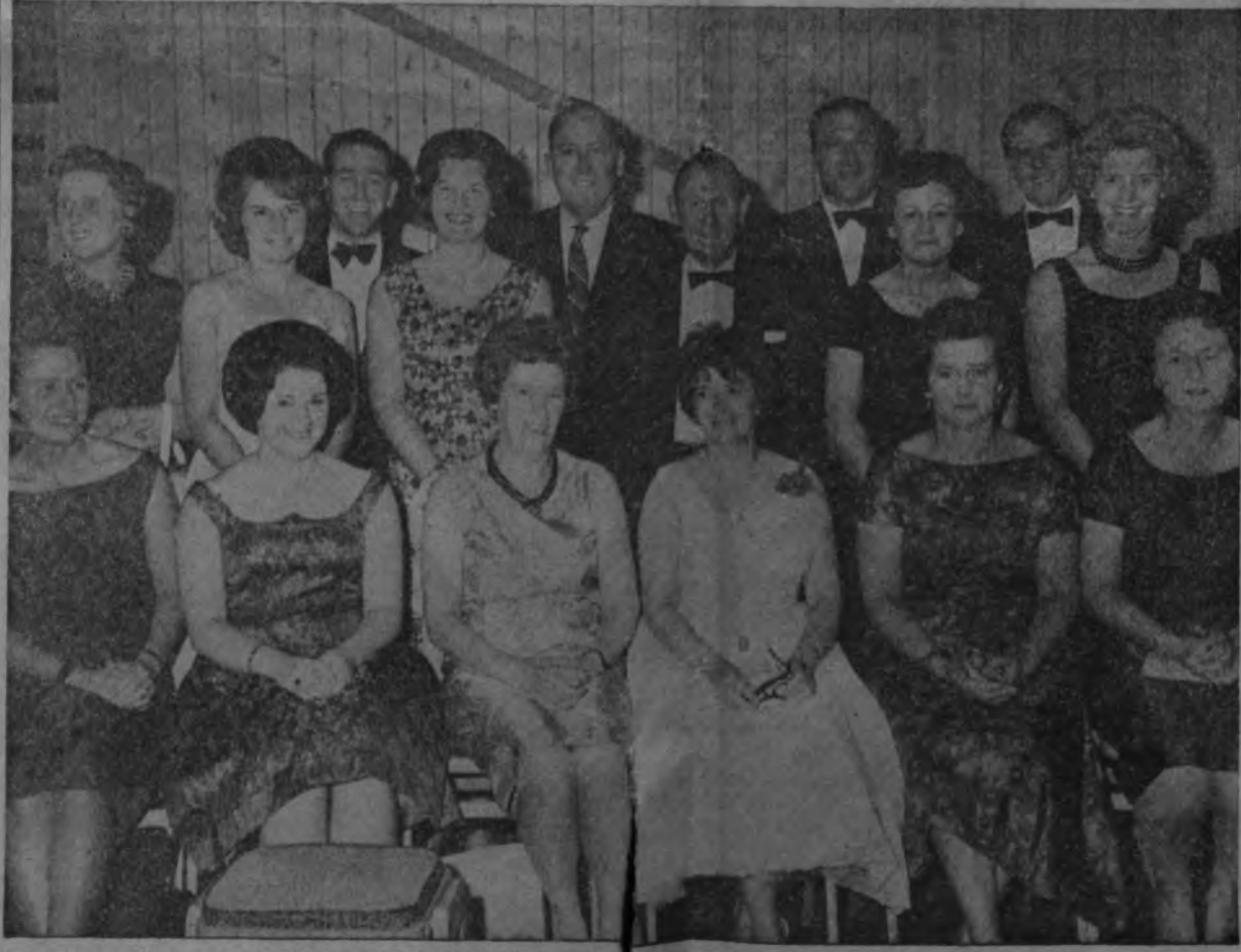
Members and guests of the Southcliffe Golf Club, during a social evening at Moor Lodge Hotel, Branston.

prior to moving to new and more modern premises, we are now holding a removal sale