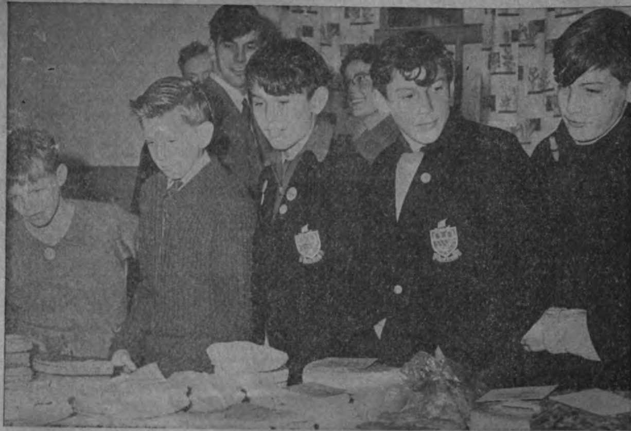
Above: Boys and cakes always go together and the Sturton and Stow Agricultural and Horticultural Association Show, was no exception.