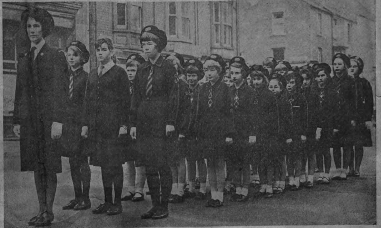
Above: Members of the newly formed Lincoln Companies of The Girls' Life Brigade who took part in the first combined church parade of Lincoln companies at South Bar Congregational Church, Lincoln.