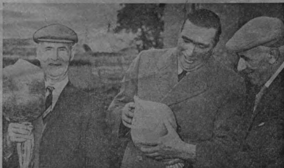
Below right: Admiring some of the blooms.