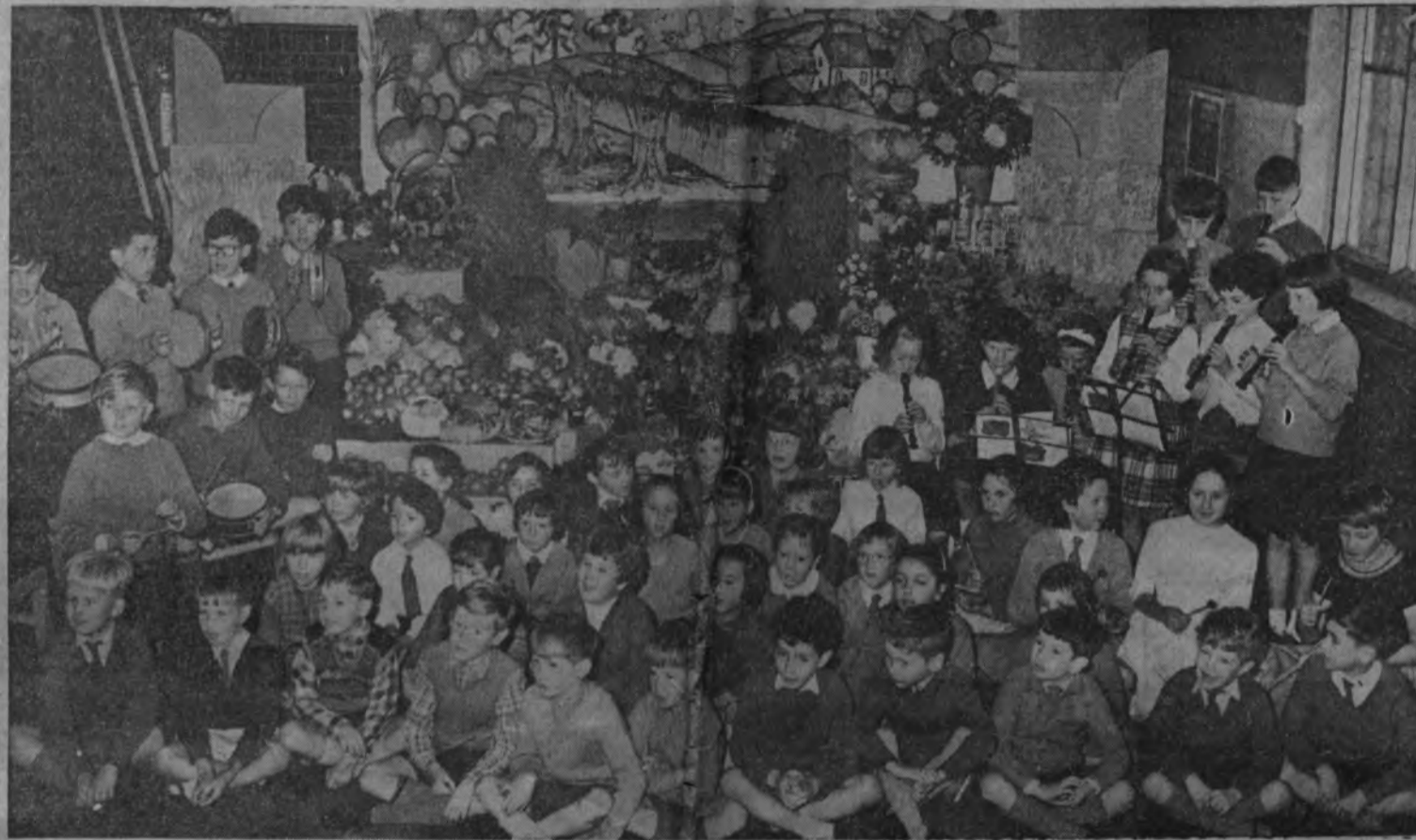
Above: Members of the choir, recorder group and percussion group of Bracebridge Heath Junior school, at their harvest festival service in the school hall.